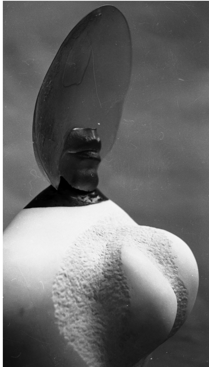
Dot Gain 15%