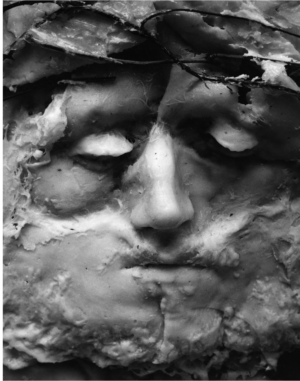
Dot Gain 10%