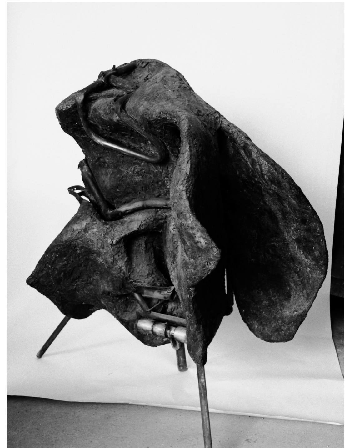
Dot Gain 10%