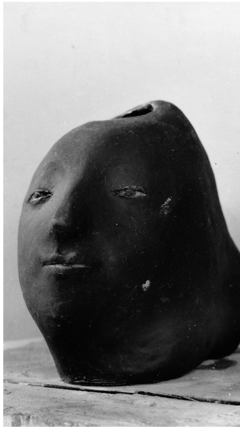
Dot Gain 10%