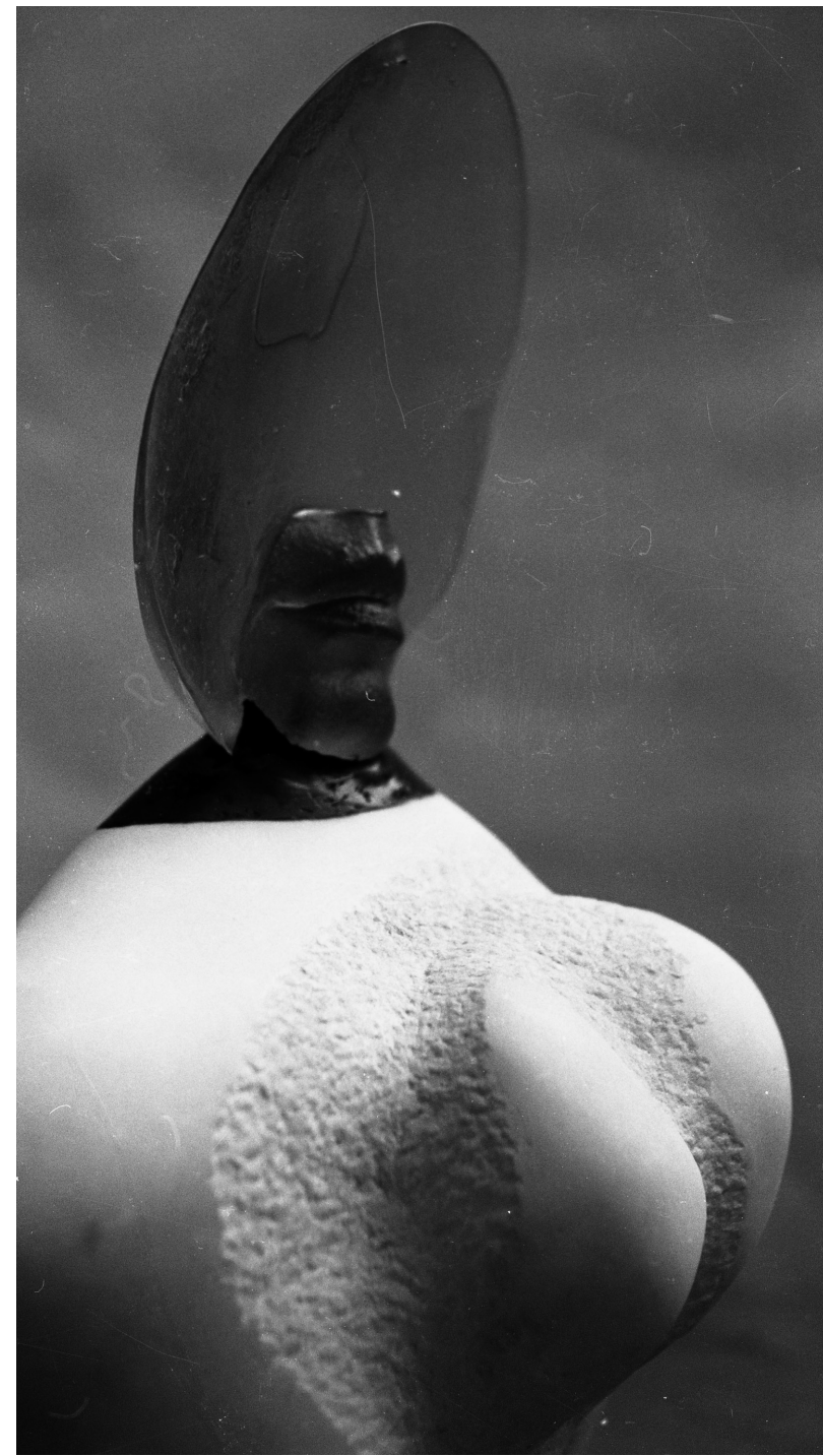
Dot Gain 10%